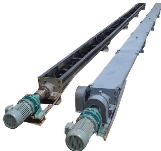
Fig. 1. Inclined screw conveyor [9]

Screw conveyors are used as devices collecting material from various types of tanks and silos. They are also used to dose the product in technological processes. Due to the closed structure, the transported material can be isolated from the environment.