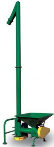
Fig. 2. Vertical screw conveyor with a feeder [10]

Screw conveyors are divided into two types: with closed trough and open trough. The former usually have a trough in the shape of a tube or "U" shape with lids, while the latter have a "U" shape (without lids).