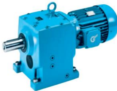
Fig. 5. SK62 type gearmotor [11]

The drive unit (Fig. 4, Item 5) is a combination of a two-stage gearmotor with an electric motor. On the basis of preliminary calculations, to achieve the expected capacity of 20 t/h, use of the SK62-106M geared motor from NORD Napędy Sp. z o.o., with a power of 9.2 kW and rotational speed of the output shaft, equal to 201 rpm, was assumed. The driving torque will be transmitted to the screw shaft through a belt transmission to achieve the required output of the device. The gear ratio of the belt transmission was assumed to be approximately 1.09. The gearbox will be equipped with C-type V-belts. Parameters such as the length and wrap angle as well as the size of the pulleys will be specified in the final design. The gearmotor selected for use in the screw conveyor is shown in Fig. 5.